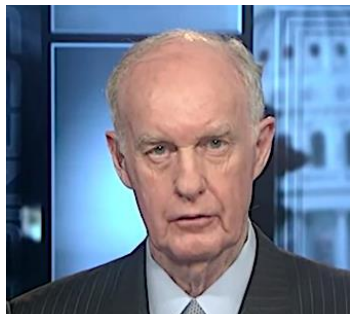
Gen. Thomas McInerney

https://beforeitsnews.com/new-world-order/2022/07/its-all-been-blown-wide-open-they-have-no-more-moves-meet-the-true-enemy-for-the-first-time-there-is-no-turning-back-now-11663.html