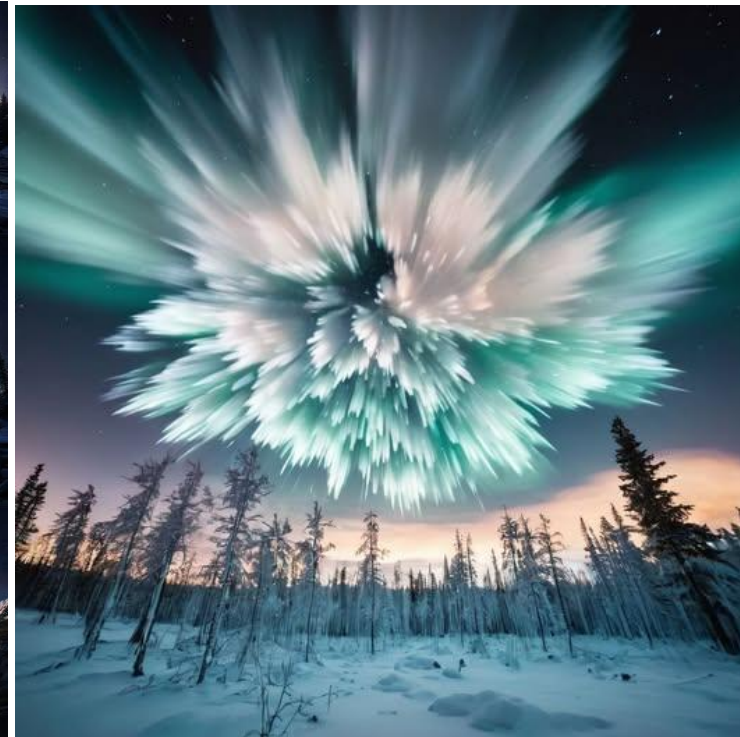
Over Alaska 1-24-2026