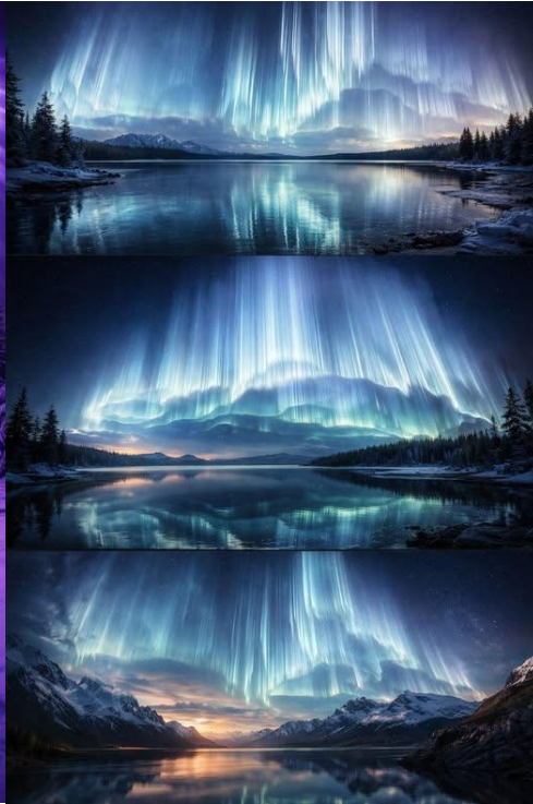
Over Norway 1-23-26