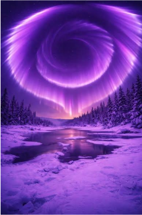
Over Alaska 1-23-26