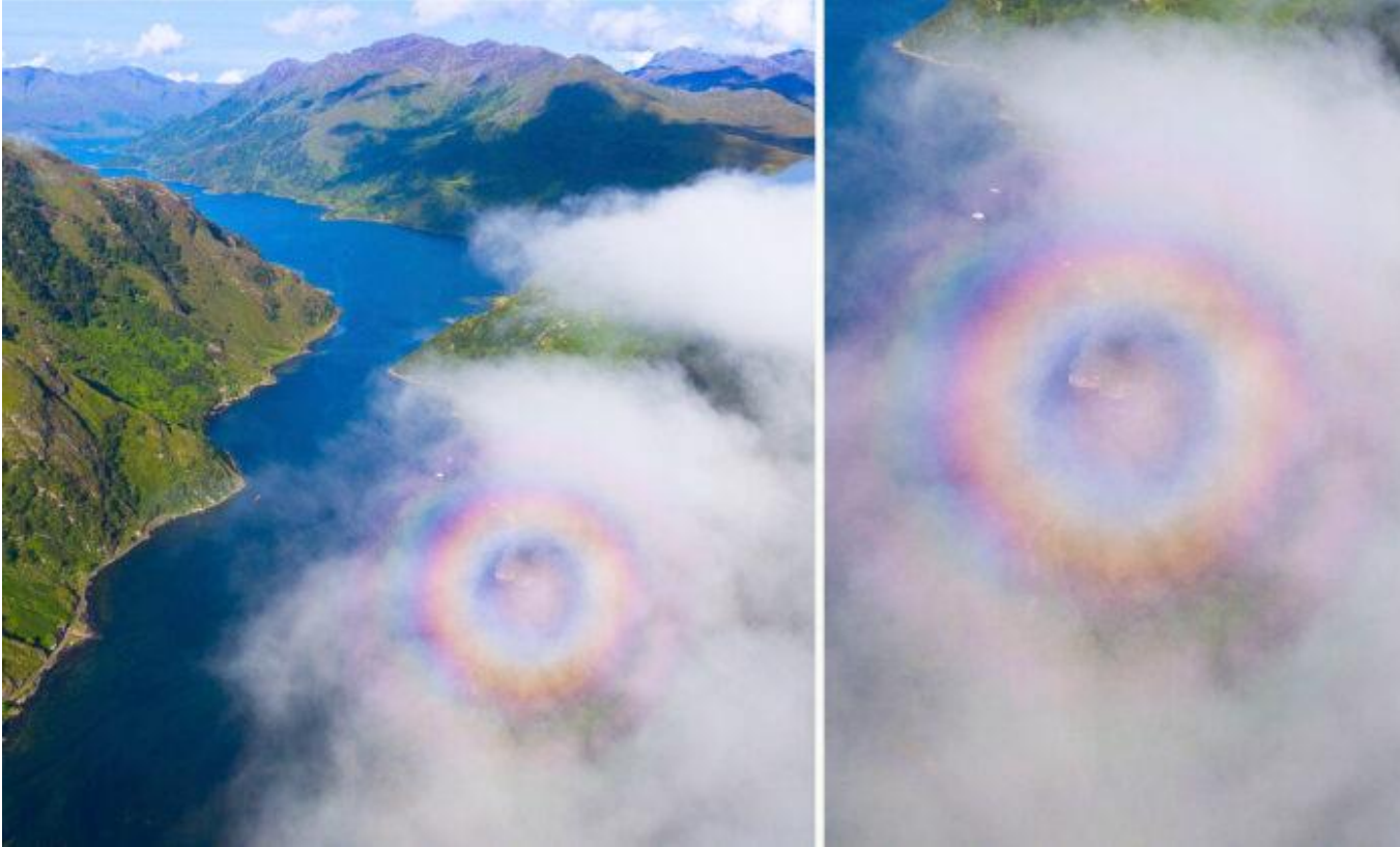
Camper Captures an Image of a Circular Rainbow: 'It Was One of the Most Magical Scenes' (theepochtimes.com)

The good news is the beauty and mystery of the Creator's Earth. Don't you wonder what caused this?: